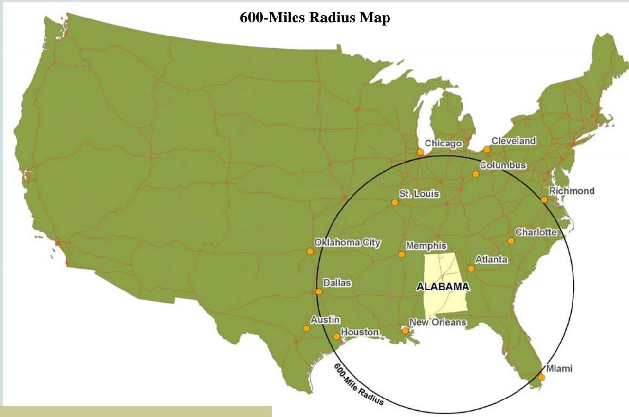
600-Miles Radius Map

An eleven hour drive time from the center of Alabama reaches west to Dallas/Fort Worth, north to Chicago, east to Charleston and south to Fort Lauderdale.